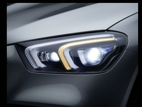
MULTIBEAM LED headlamps