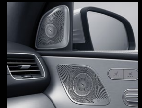
Burmester® surround sound system