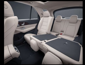
3rd row of seats for 2 people