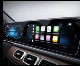
Apple CarPlay™ & Android Auto, Widescreen Cockpit™