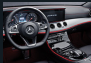
Cockpit & Interior