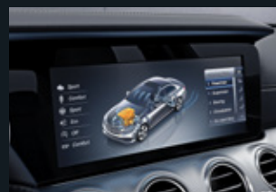
AMG DYNAMIC SELECT