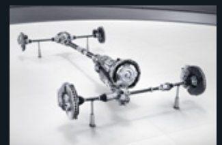
AMG tuned 9G-TRONIC with 4MATIC system