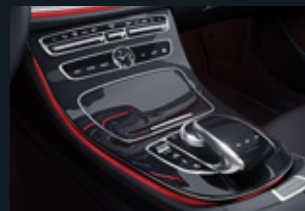
AMG carbon trim