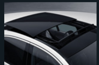
Panoramic Sliding Sunroof