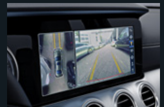
Surround view system