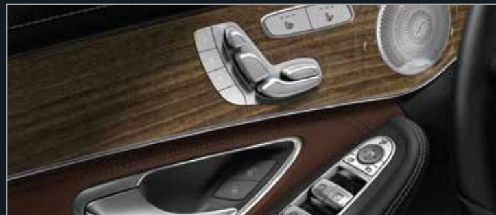
Electrically adjustable front seats with memory function*