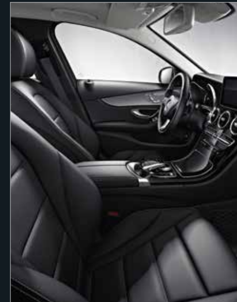
ARTICO leather upholstery - Black