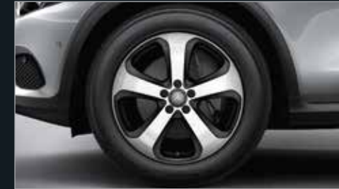
19-inch 5-spoke light-alloy wheels*