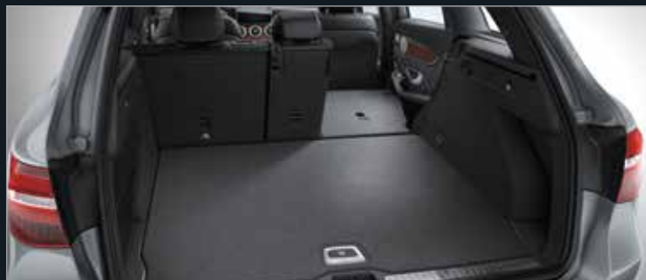
Load compartment with foldable rear seats