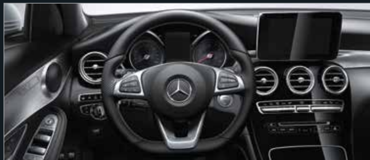
3-spoke multifunction sports steering wheel in black leather, with flattened bottom section*