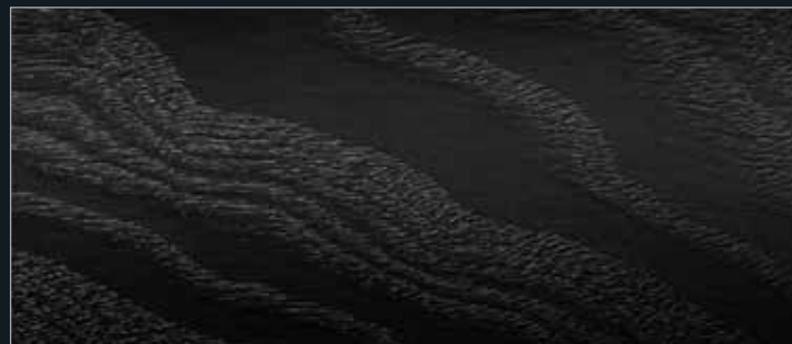
Black open-pore ash wood trim