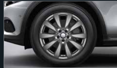
19-inch 10-spoke light-alloy wheels