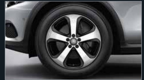
19-inch 5-spoke light-alloy wheels*