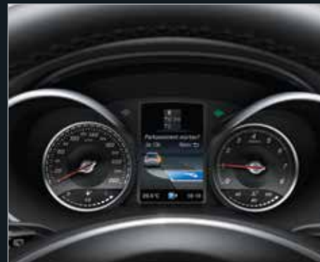
ACTIVE PARKING ASSIST