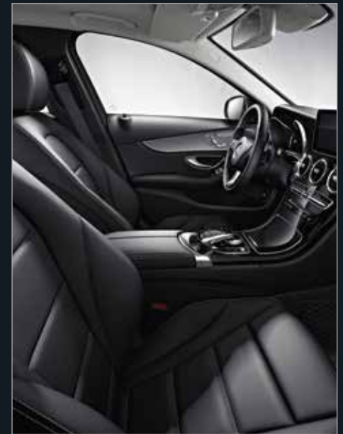
ARTICO leather upholstery - Black