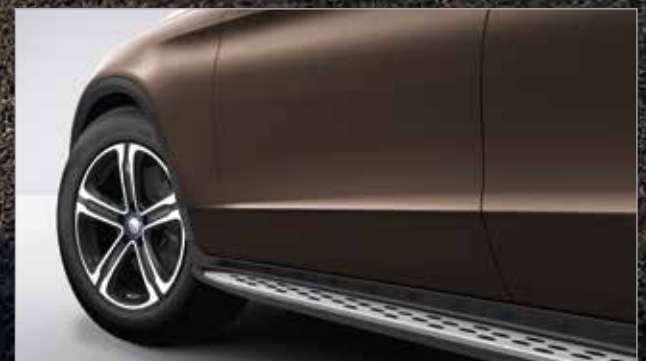
Aluminium-look running boards with rubber studs