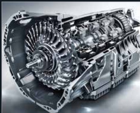
9G-TRONIC automatic transmission