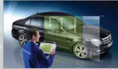
Vehicle's trace record warranty