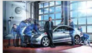
Certificate warranty from qualified technicians