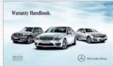
Equipped with ProvenExclusivity warranty