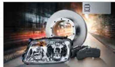
Maintenance warranty with genuine Mercedes-Benz spare-parts