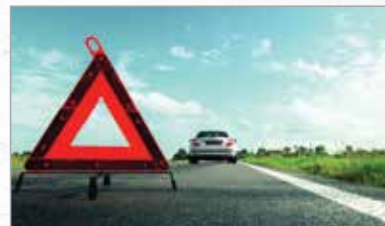
24 Hour Roadside Assistance Service

We are committed to fulfill your needs by providing a wide range of products from the Mercedes-Benz line-up : Only the very best, for you to choose from.