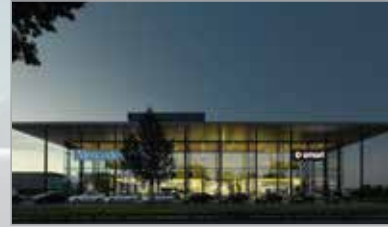
Vehicle's origin warranty

Mercedes-Benz also provides certified pre-owned cars with various benefits and warranties for your consideration. The pre-owned cars have passed a "ProvenExclusivity Multipoint Technical Checklist" which is handled by qualified and experienced technicians to guarantee that the cars are in prime condition. All of this is for a comfortable and tranquil driving experience.