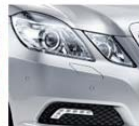
Striking headlamp design with LED technology