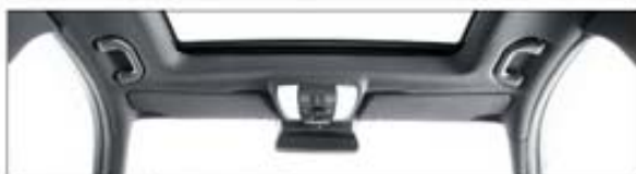
Panoramic glass sunroof