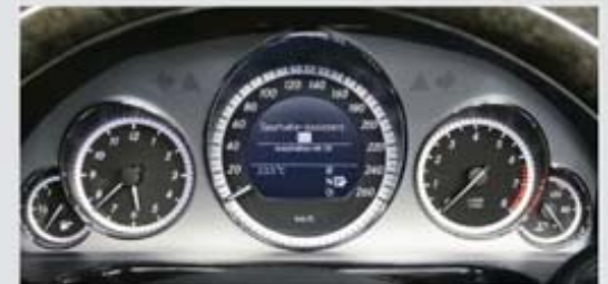
Instrument Cluster featuring five sporty looking tubes and a light silver backplate for AVANTGARDE