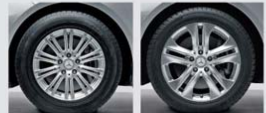
10-twin spoke light-alloy wheels 17" for ELEGANCE

The E-Class knows when to keep its distance. Whether out on the road or manoeuvring in and out of parking spaces, it is able to avoid getting too close to other vehicles, leaving you to enjoy a marvellously reassuring sense of security from the start of your journey to the finish.