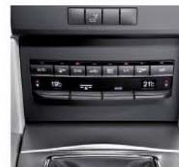
THERMATIC automatic climate control