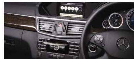
Radio Audio 20 CD with integrated 6 CD-Changer