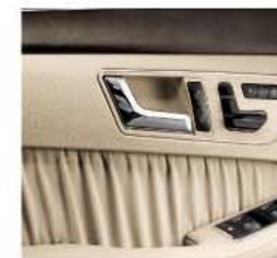
Electrically adjustable front seats with memory function