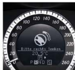
PARKTRONIC incl Parking Guidance