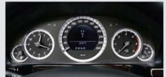
Instrument Cluster featuring five elegantly styled dials for ELEGANCE