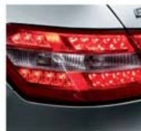
LED tail lights incl LED indicators