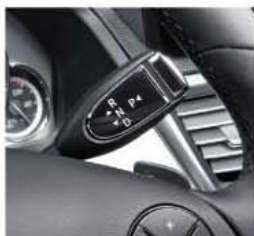
DIRECT CONTROL steering